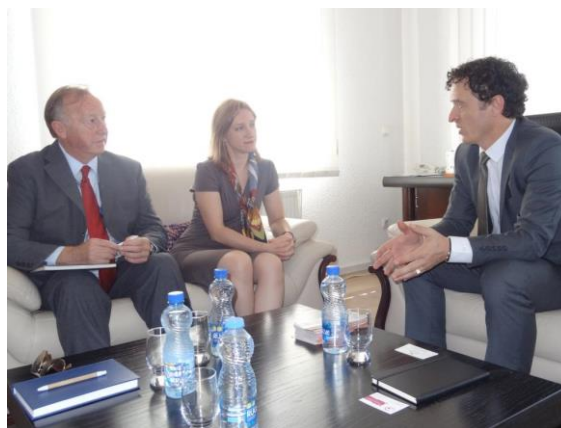
Meeting with the Ombudsperson of Kosovo